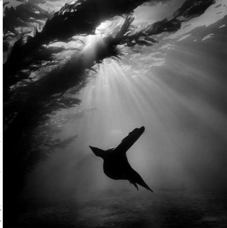
Winged Angel, Santa Barbara Island