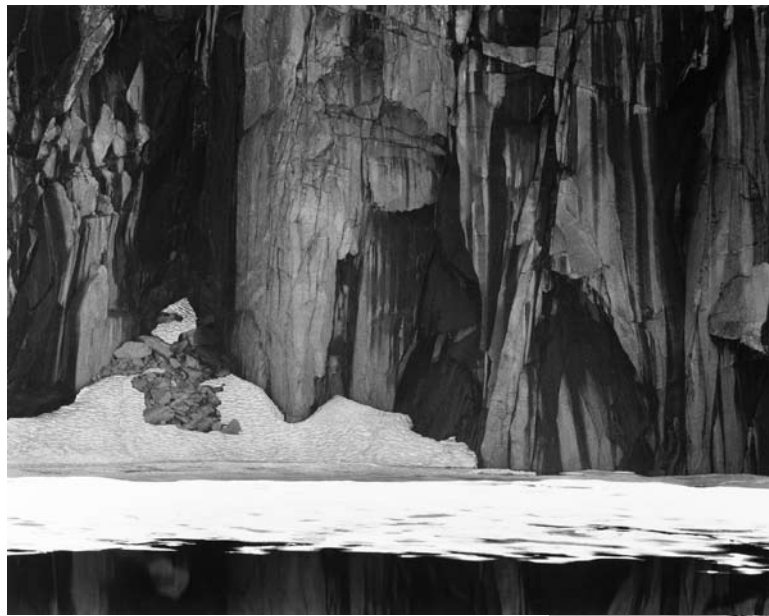
Frozen Lake and Cliffs, Ansel Adams, 1932

—President James E. Carter Presenting Ansel Adams with the Presidential Medal of Freedom