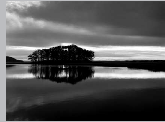
Witch Island, Daybreak, The Great Marsh, Ipswich MA, ©2002 Dorothy Kerper Monnelly