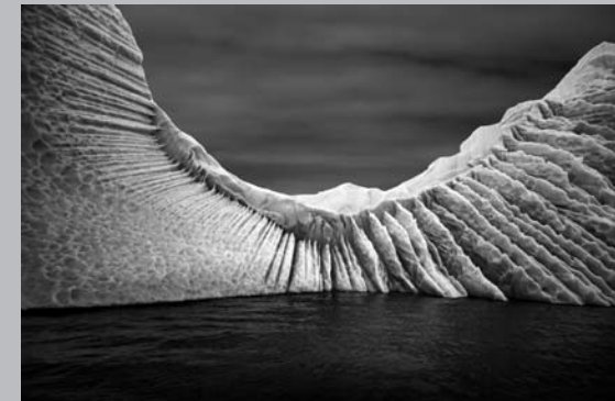
Winged Wall, Antarctica