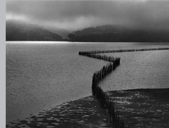
Oyster Fence, Tomales Bay, Ansel Adams, 1953, courtesy of the Ansel Adams Publishing Rights Trust.